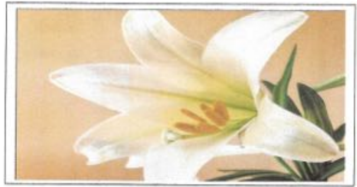
Easter Lily In Honor/Memory

On Father's Day, we will have the Tools for Hope offering. With all the bad weather that has been experienced this year, so many areas are in need of rebuilding. This is an opportunity to give so that Church World Service can provide tools and materials for this work.